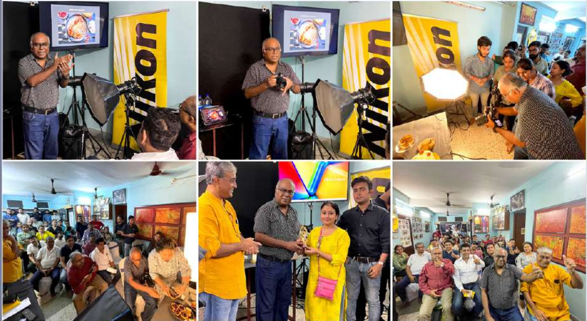
World Photography Day celebration: Food Photography by NIKON India Ltd. (24/08/25)