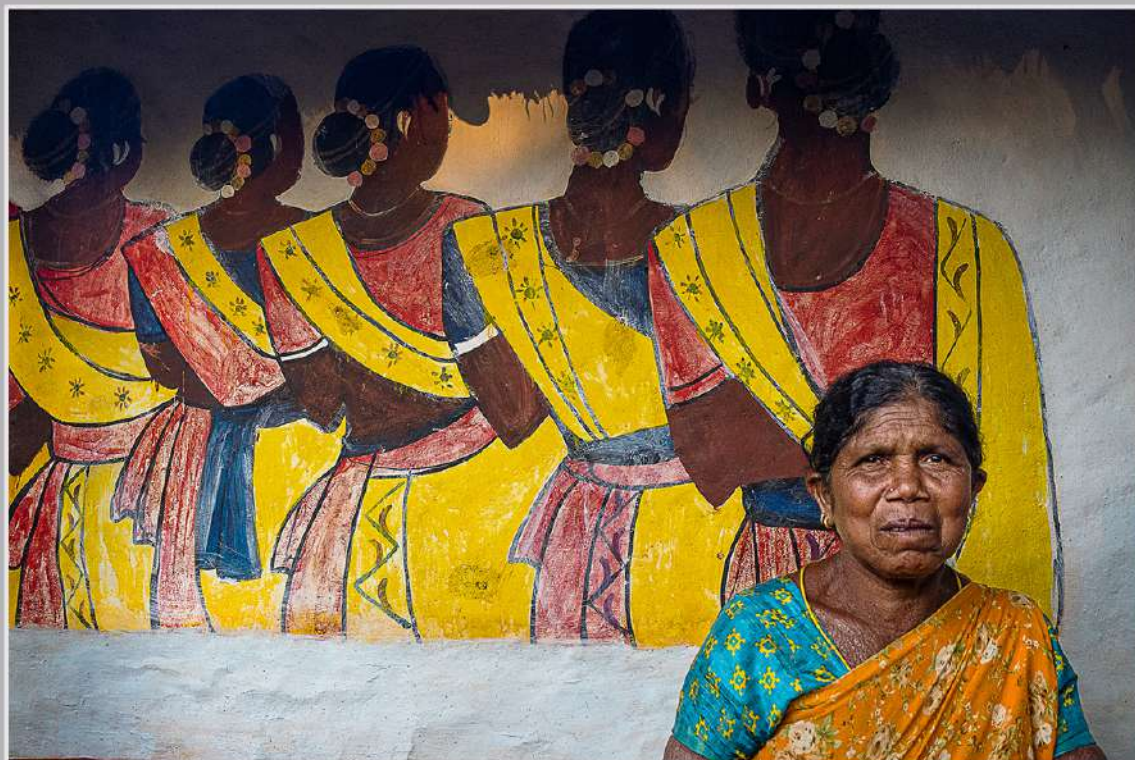
Tribal Photography at Araku