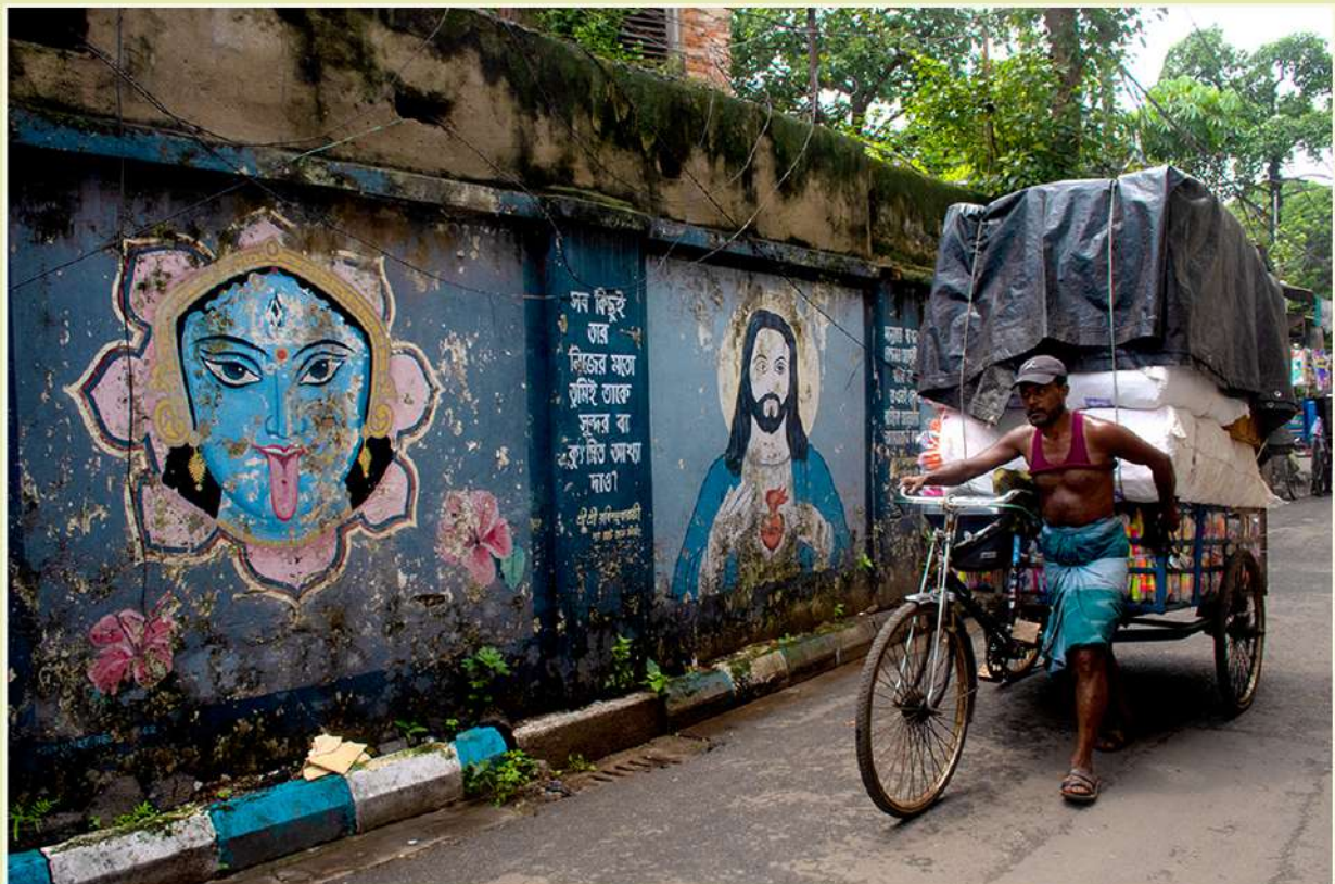
Lanes of Kolkata