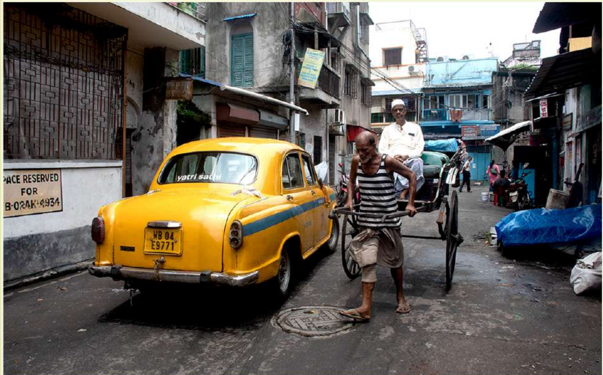
Lanes of Kolkata