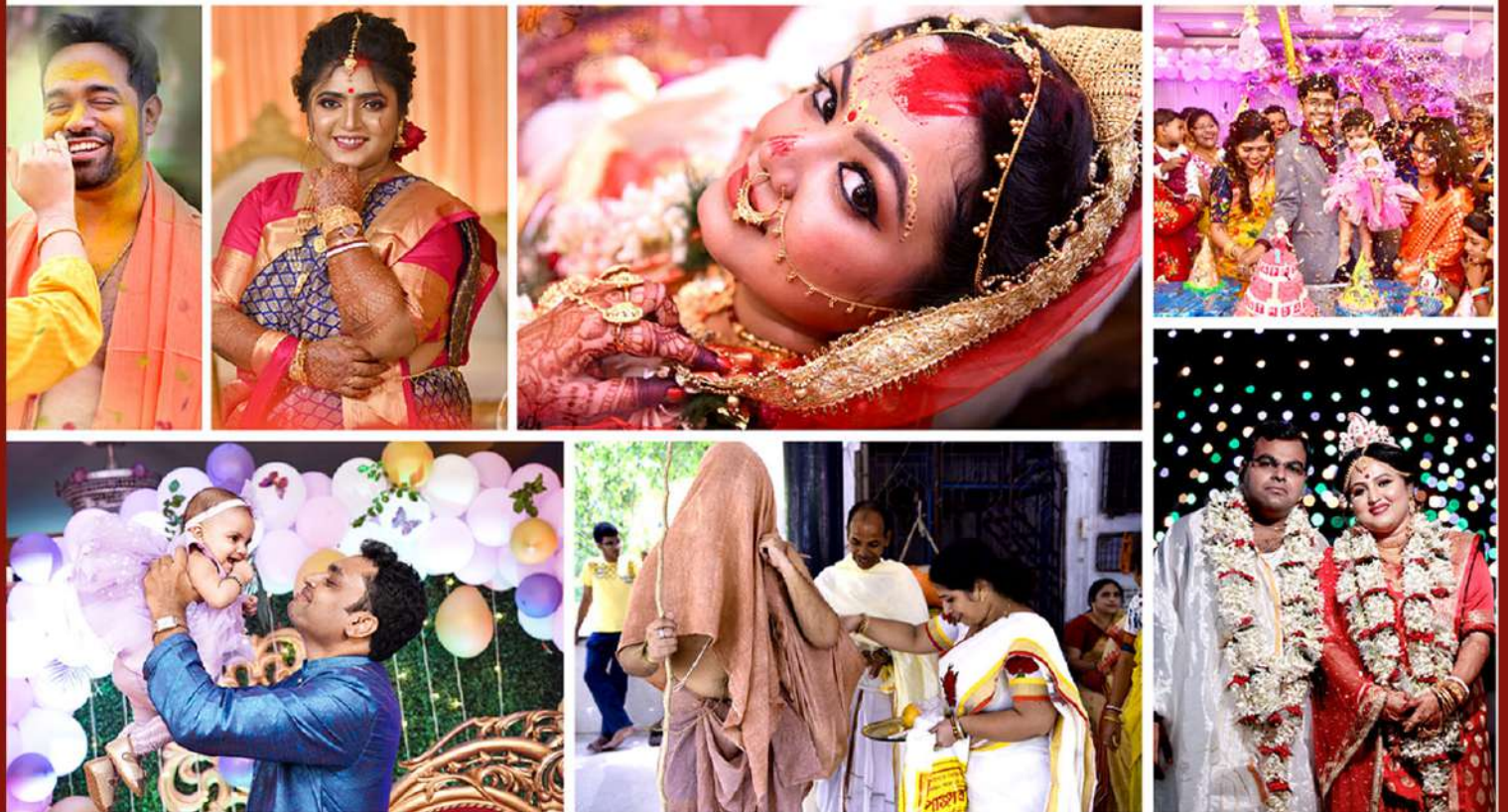
1 2 3 4 7 6 5 1. HALDI RITUAL 2. RECEPTION 3. WEDDING 4. BIRTHDAY 5. WEDDING 6. THREAD CEREMONY 7. RICE CEREMONY