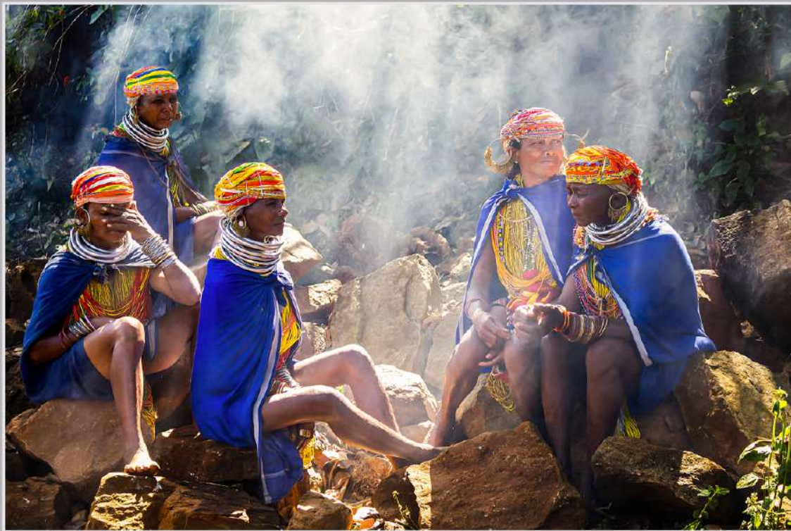
Tribal Photography at Araku