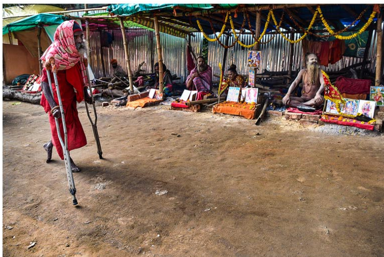
Gangasagar Transit camp (05/01/23)