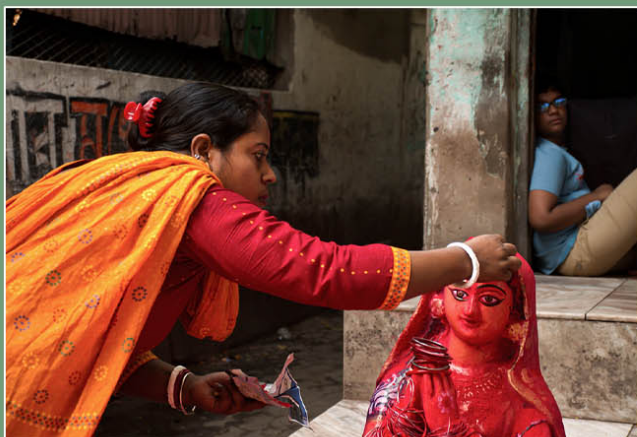
Bengali New Year Ritual (15/04/23)