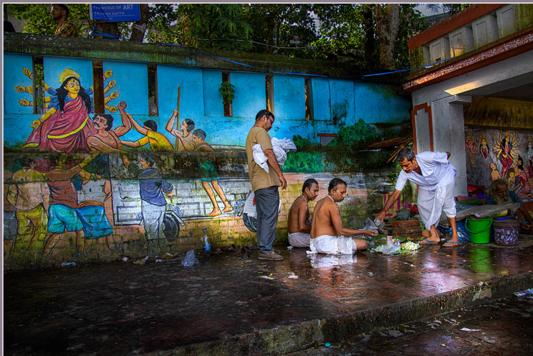
Torpon Ritual (14/10/23)