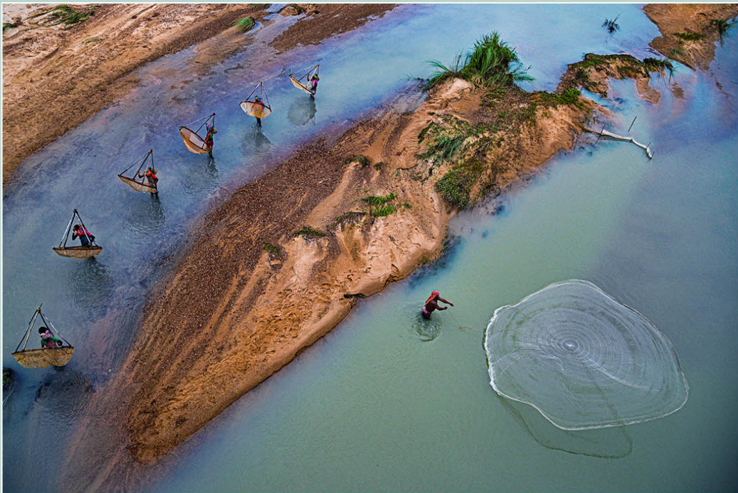
Fishermen activity at Midnapure (05/08/23 - 06/08/23)