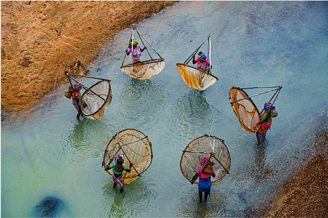
Fishermen activity at Midnapure (05/08/23 - 06/08/23)