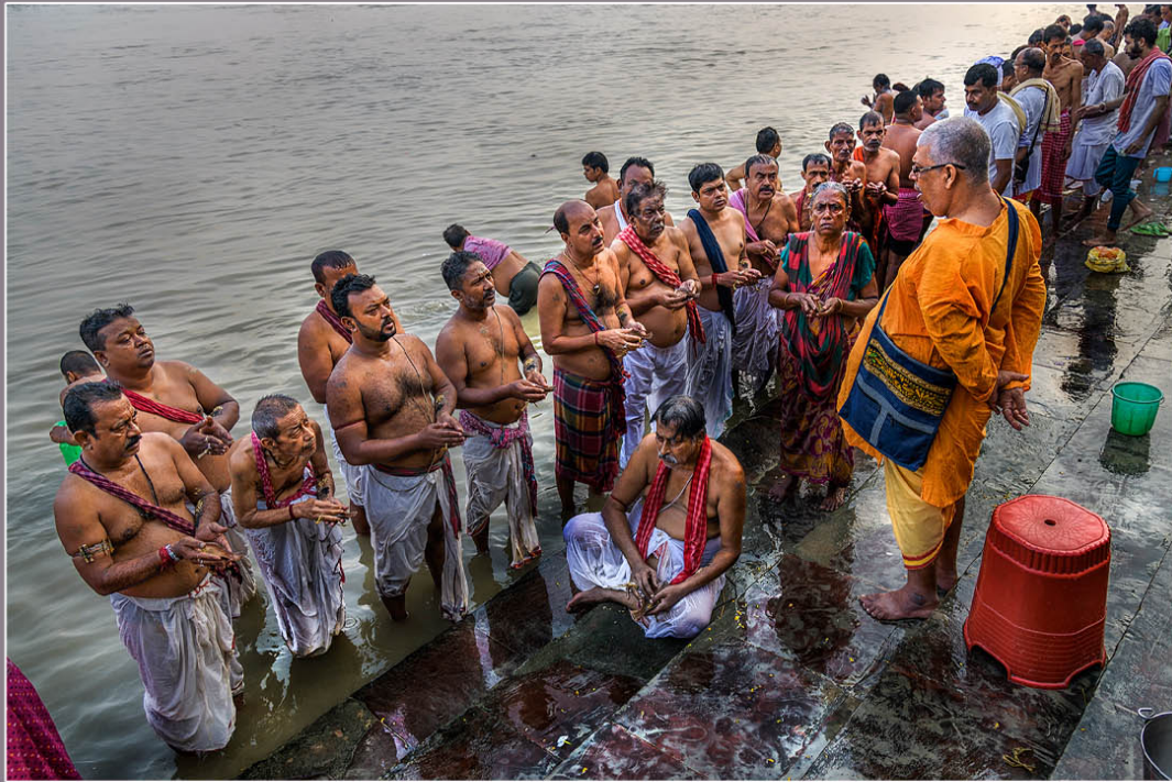
Torpon Ritual (14/10/23)